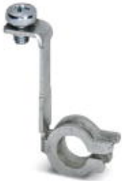
PE contact for UM-PRO panel mounting base for connecting the PCB to the DIN rail at level 1

Please be informed that the data shown in this PDF Document is generated from our Online Catalog. Please find the complete data in the user's documentation. Our General Terms of Use for Downloads are valid ( http://phoenixcontact.com/download )